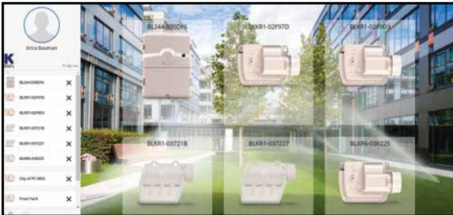
Central programming from a web browser.